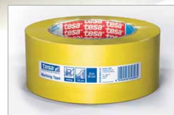
tesa® 60760 packed