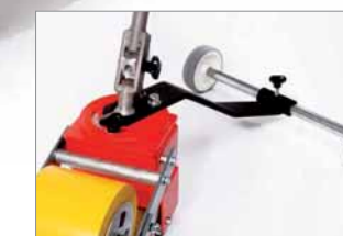
Durable for curves and fixed radius