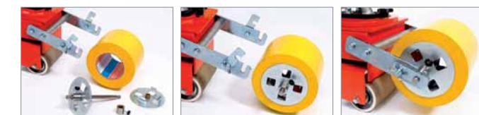
Fast and convenient roll change