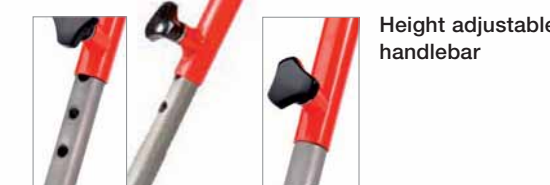
Height adjustable handlebar