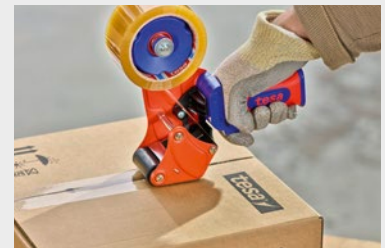
Suitable for manual and automatic applications