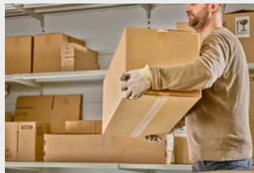
Ideal for for medium-weight packaging applications (15-30 kg)

The new tesa® 60400 can help your company to use environmentally friendly materials with consistently high quality. As an innovative, sustainable product, it integrates seamlessly into your production process and helps you to achieve the prescribed sustainability goals. And your customers will also be impressed by the proactive approach to sustainability taken by your company – a brand value that is set to become much more important in the future.