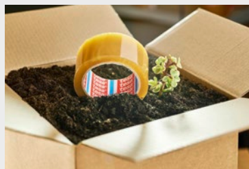
98% bio-based carbon content